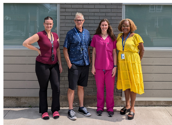
Health Care at Eva Rothwell Centre, Hamilton FHT, Greater Hamilton Health Network