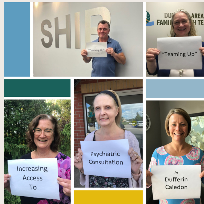
Dufferin Area FHT and SHIP (Services and Housing in the Province)