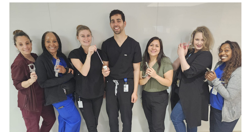
Toronto Western FHT