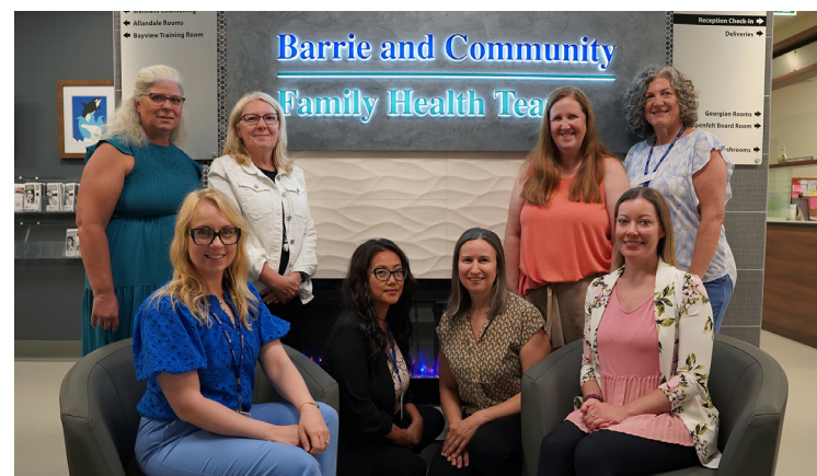
Barrie and Community FHT Bone Health program