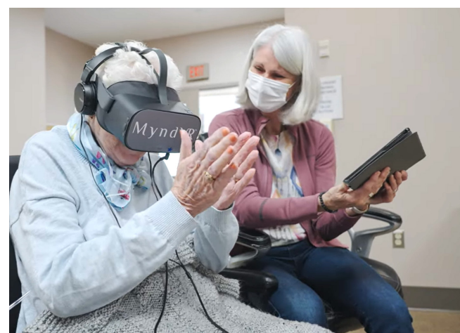
Enhancing senior wellbeing with virtual reality adventures, Parry Sound FHT