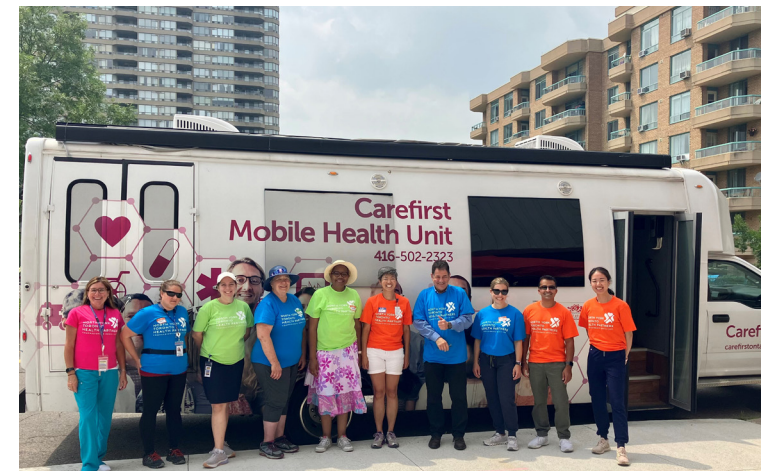
North York FHT Community Health and Information Fairs

Congratulations ✨ to all our winners and nominees! ✨