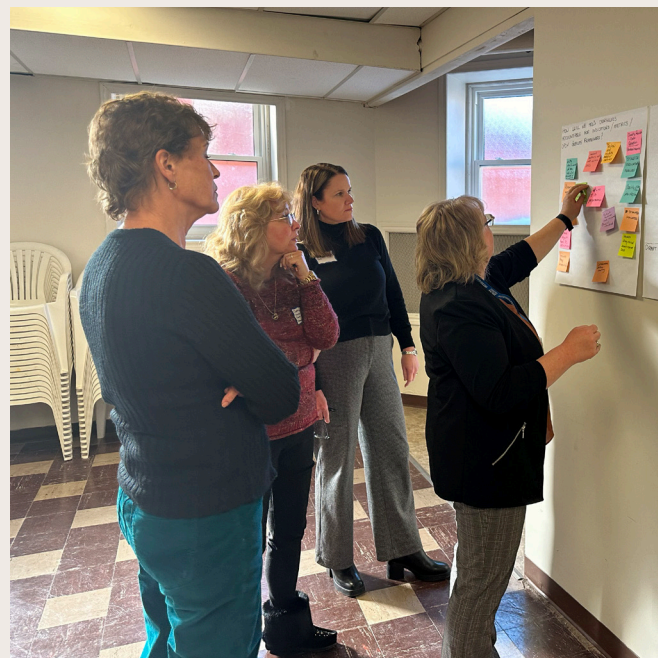
Palliative care navigation, Grey Bruce OHT

We are excited for what's to come and working with our members and partners we will relentlessly pursue our vision of achieving equitable access to excellent team-based primary care for every person in Ontario.