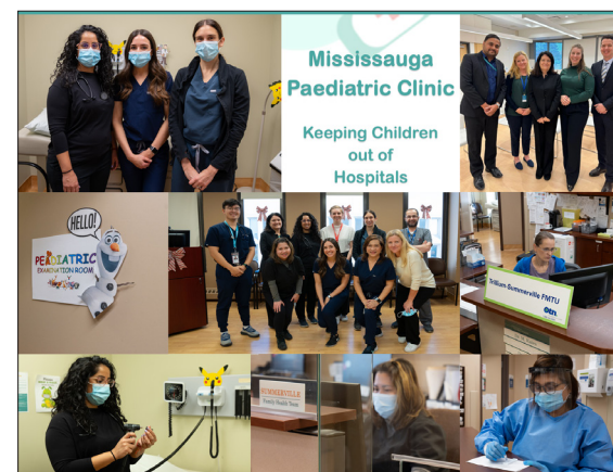
Mississauga Paediatric Care Clinic, Mississauga OHT