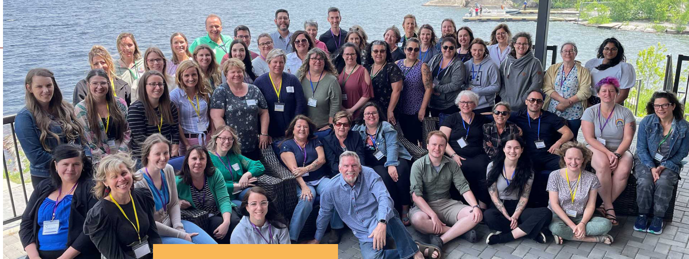
Team retreat, City of Lakes FHT