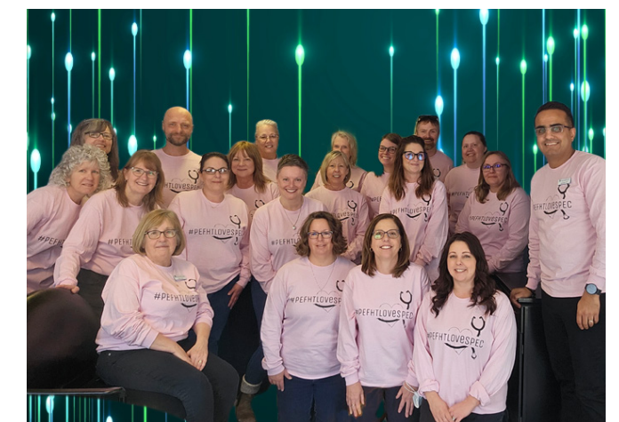
Prince Edward FHT Community Clinic