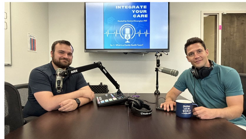
International Agricultural Worker Program, Norfolk FHT | Integrate Your Care Podcast, hosted by Central Brampton FHT