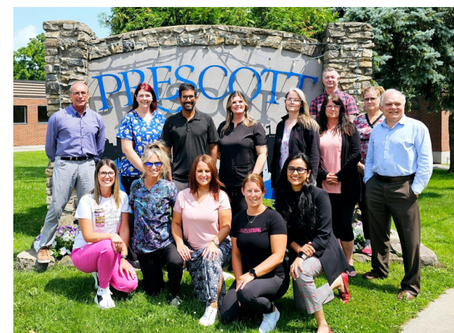
Prescott FHT Workplace Wellness Committee